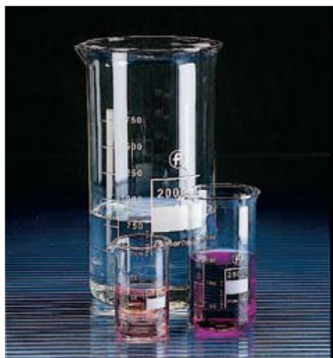
Beakers, borosilicate glass, tall form, ISO 3819, DIN 12331