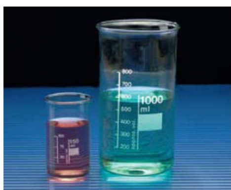
Beakers, borosilicate glass, graduated, tall form, without spout