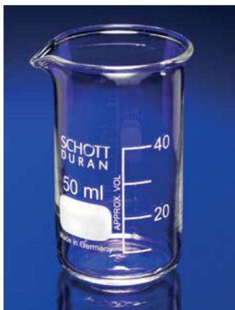
Beakers, Duran® glass, tall form, ISO 3819, DIN 12331